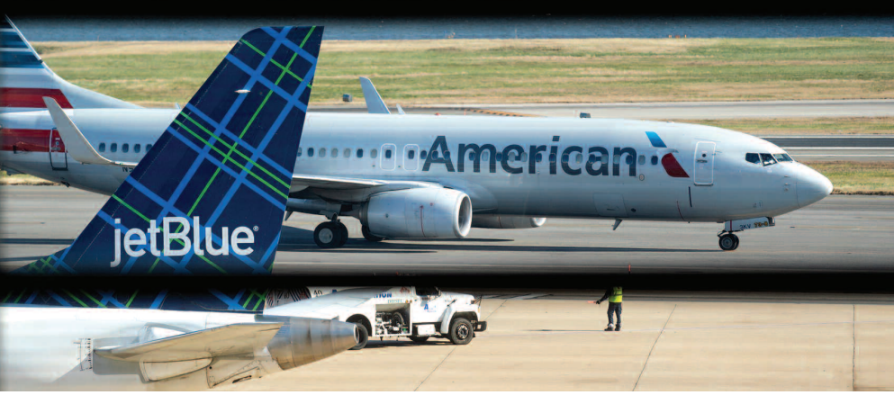
JetBlue, American's move may be the carriers' best shot at salvaging the NEA in some form after the judge ruled it violated US antitrust laws

The Justice Department and the airlines submitted dueling