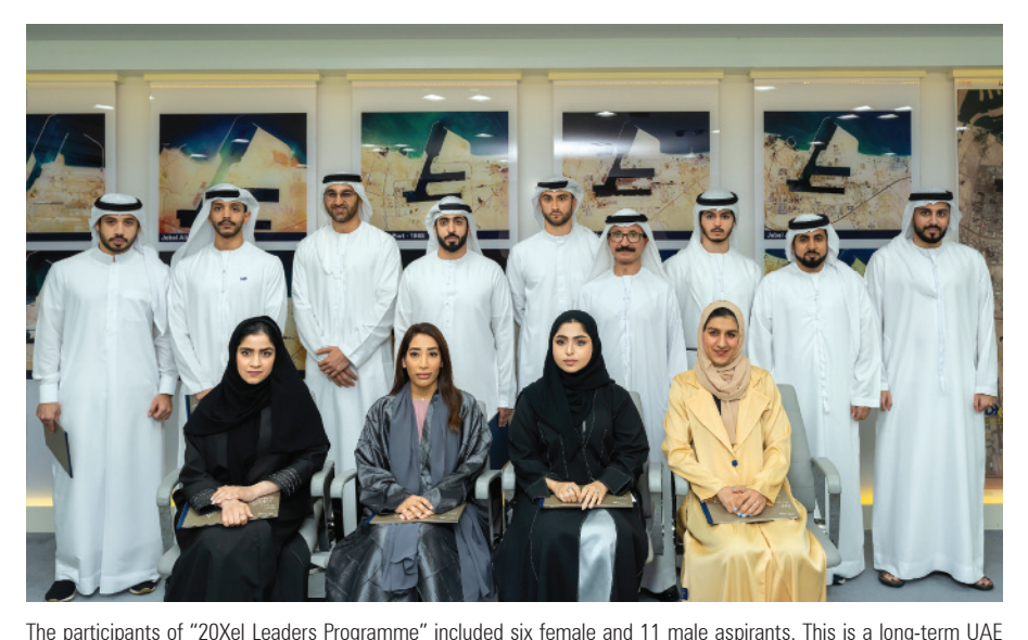
national talent development programme aiming to accelerate Emirati talent development and growth sectors of the economy. DP

It has become part of the company's success story, shifting from being a local port operator to a global logistics solutions provider, with talented young Emiratis contributing significantly to making the