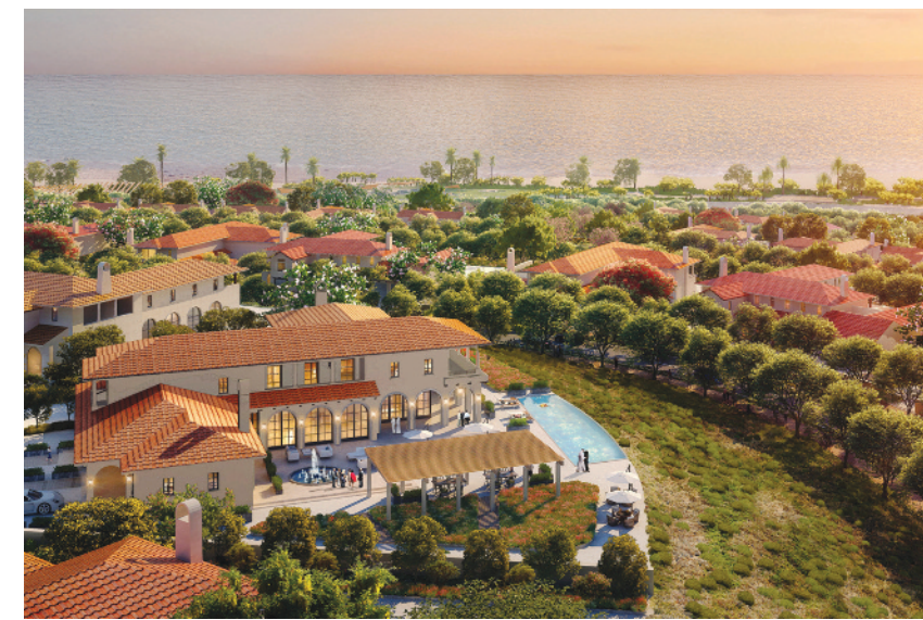
Spanning more than 51 million square meters, equivalent to 53.8% of Abu Dhabi Island, the Hudayriyat Island project is a key contributor to achieving the emirate's strategic vision by driving the city's urban expansion

THE TOTAL trade exchange between the UAE and Kazakhstan exceeded about $632.6 million at the end of 2022