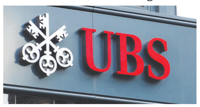
UBS completed the acquisition of former rival Credit Suisse, sealing the biggest merger in banking since the 2008 financial crisis and creating a global wealth-management titan

UBS is currently holding its inaugural Future Now Asia Pacific conference in Hong Kong which focuses on technol-